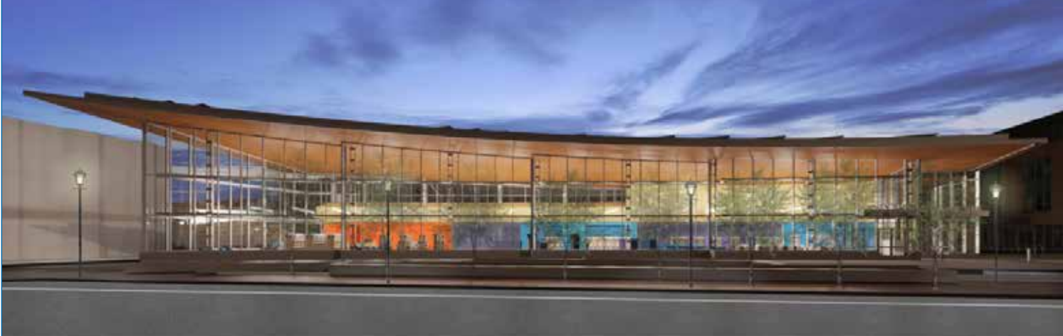
Cambridge Public Library

In the 21st century, libraries must continue to serve as intellectual and cultural centers for their communities by maintaining strong collections of books, periodicals, and other types of media, in both physical and digital formats. At the same time, they must also provide access to an expanding world of information and keep pace with changes in information technology. It is clear that libraries play a critical role in preparing Massachusetts residents to meet the challenges of the future.